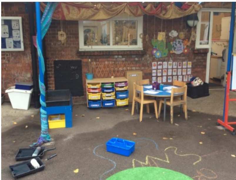
Writing and mark making area