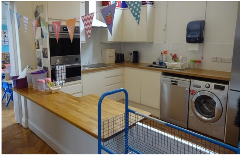
Our kitchen area