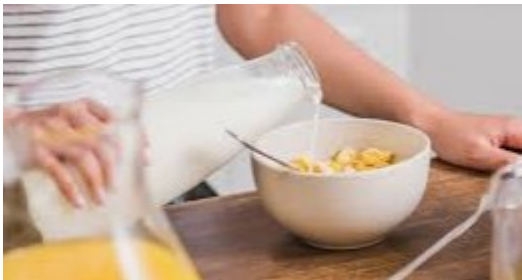
Our snack area