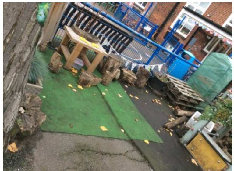
Bug investigation area